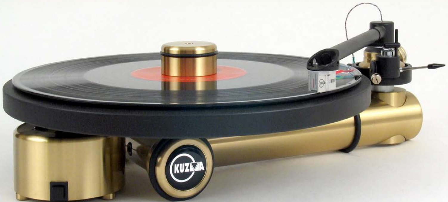
Kuzma Stabi S Turntable